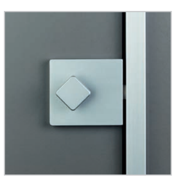
Lock cover plate with integrated turn lock