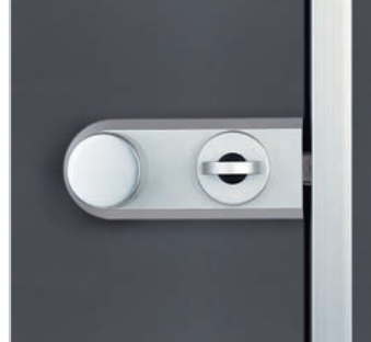
Beautifully shaped lock cover plate with solid zinc die-cast lock