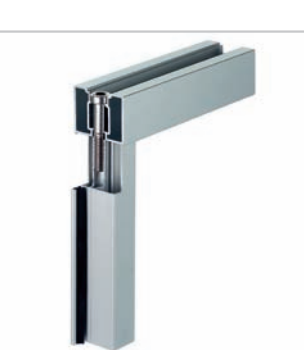
Connection of the profiles with solid M12 screw connection