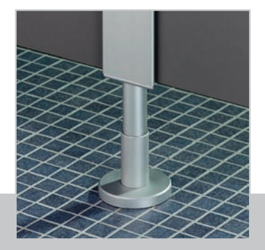
Aluminium supporting leg in the front panel in a static connection with the profiles

Trend-setting architecture is among other things a matter of technology. During development, particular attention was therefore paid to the connection elements.