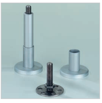
Supporting leg detailed - adjustable height with solid cover sleeve