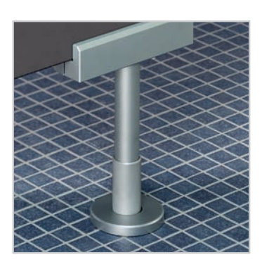
Supporting leg bracket for support-optimised legs in the partition panel