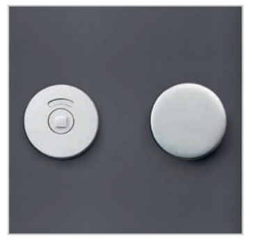
Door knob with parallel positioned red/white indicator