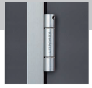
3-part-edge hinge (3 per door) made of aluminium with integrated spring for self-closing doors

The high quality aluminium system structure with the aesthetic profiles and linear connections ensure an indestructible and solid cubicle system that is minimalist and flexible.