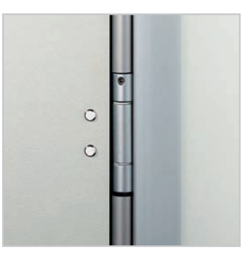
Finger protection with integrated hinges for cronus NR