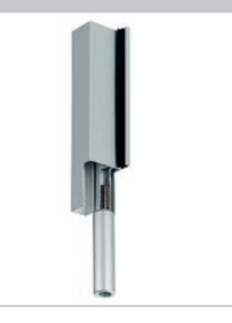
Solid M12 screw connection of the supporting legs in the profiles