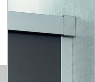
Wall connection profile with rosette Corner profile for free-standing for accurate joints