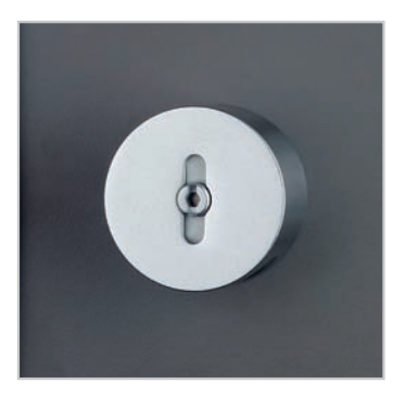
Ergonomic turning knob with integrated red/white indicator