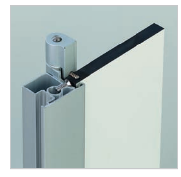
HPL door with door stop profile - hinges screwed hidden from sight